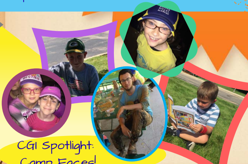
CGI Spotlight: Camp Faces!

REMINDER: PLEASE WEAR YOUR CAMP SHIRT ON TRIP DAYS